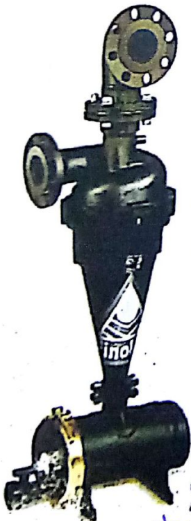
Hydro Cyclone Filters Sizes : 2", 3"